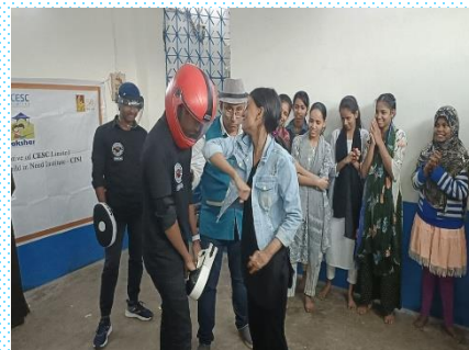
A student trying out a self-defence technique