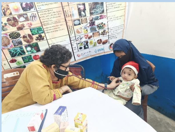
A child being examined by the doctor

On December 28, 2023, a special health check-up camp was organised for children, under 2 years old in Tiljala-Topsia, as part of SNEH Project, a CSR initiative of CESC Limited. The goal was to find and deal with health problems in children, keeping them healthy, and lessen the chance of them falling sick. The event also aimed to teach mothers in the community about taking care of their children's health and give them advice on basic healthcare and cleanliness. In all, 33 children and their mothers got help at the event. Each child was weighed and got a thorough health check-up. Free medicines were provided based on their needs, and parents were told when and how to administer them. Parents were counselled regarding the various non-communicable diseases (NCDs) and seasonal diseases of children. They also got guidance on common and seasonal illnesses in children. Most of the children had cold, cough, fever, and loose motions. Two seriously ill children were referred to the hospital for further care.