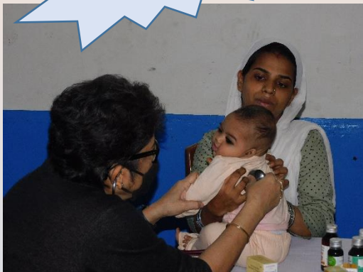
A child being examined by a child specialist at the Special Health Camp