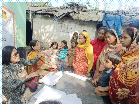
Enrollment drive under Akshar Project

The Akshar I project launched an enrolment drive to reintegrate out-of-school children, particularly those affected by the economic fallout of COVID-19, back into the educational mainstream. Three events were conducted in Topsia-Tiljala areas in collaboration with local government schools. The success of the programme was bolstered by the active involvement of schools like Monu Memorial Primary School, Public Welfare Free Primary School, Topsia Primary School, Monu Memorial Institute, Tiljala Brajanath Vidyapith, Sarada Vidya Bhavan, and others. 26 out-of-school children were successfully enrolled in various Bengali, Hindi, and Urdu medium formal schools through this initiative.