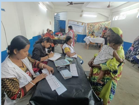
A parent registering her child for the special health camp