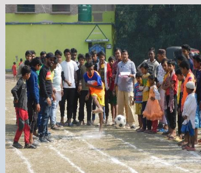
A glimpse of some sporting activities